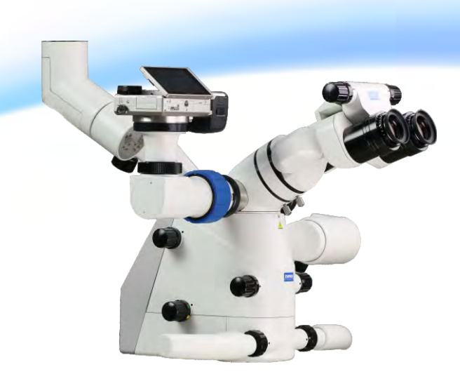
Adapter for SONY/CANON/NIKON Cameras