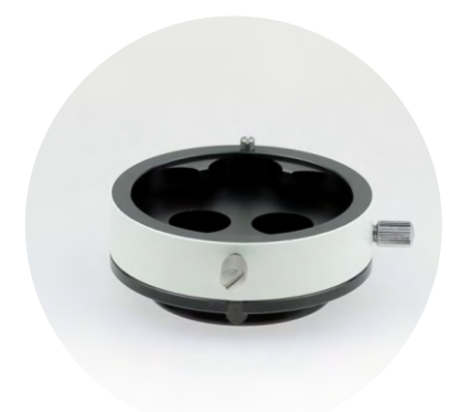
Binocular Rotation Ring