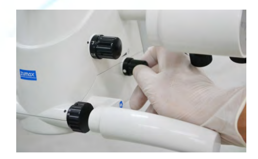
Adjust the brightness intensity