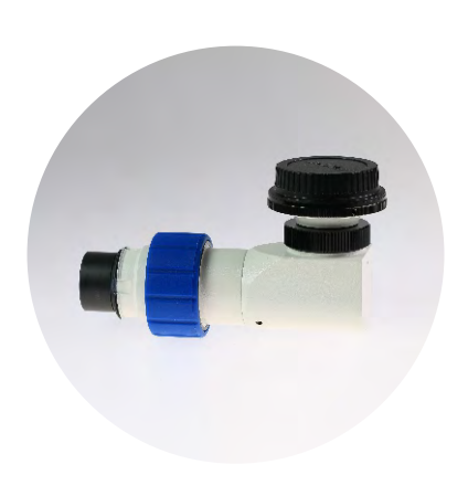
Rota 360 Digital Camera Adapter