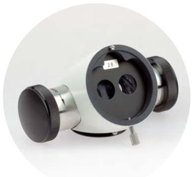
Extender & Beam Splitter (20%: 80% or 50%: 50%)