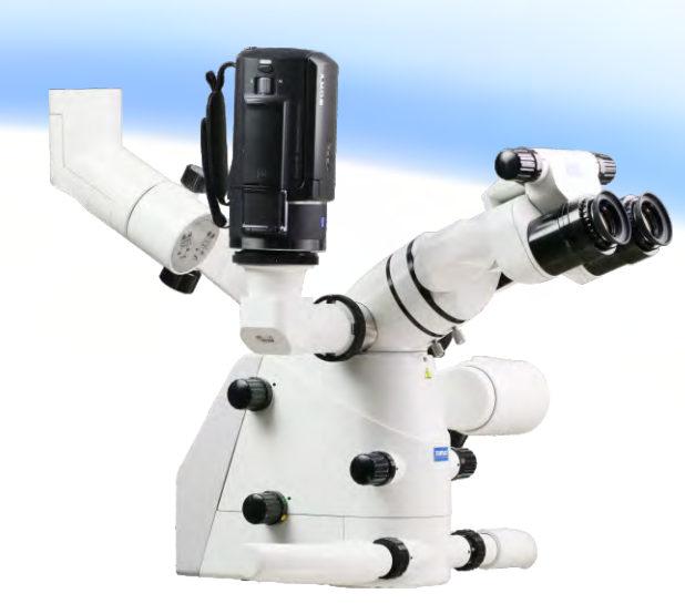
Adapter for CANON/SONY Digital Camcorder