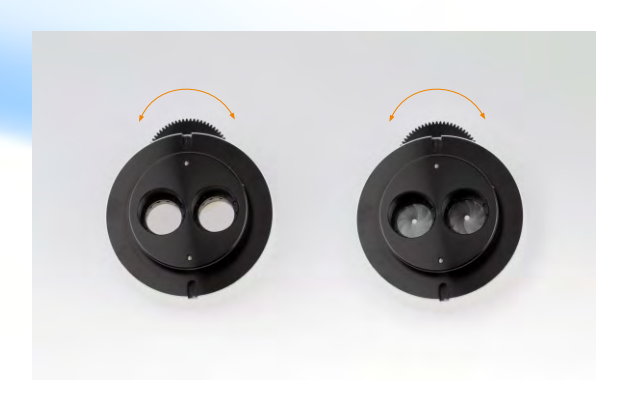
Dual Iris Diaphragm

Diode Laser: 780-830 nm Nd-YAG: 1064 nm Er-YAG: 2940 nm