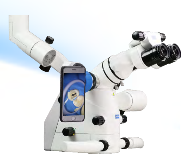
Easy 360/Easy 360 Plus Adapter for Mobile Phone