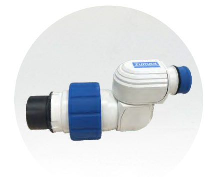
Easy360 Plus Mobile Phone Adapter