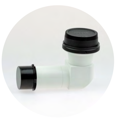
NIKON/SONY/CANON Digital Camera Adapter