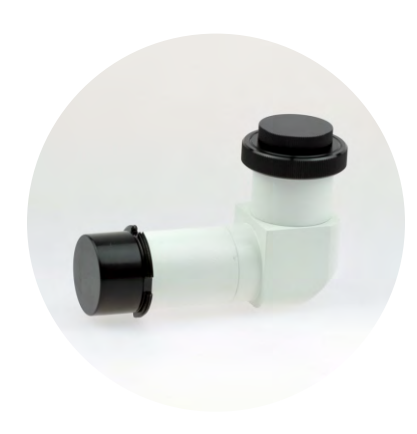
NIKON/SONY/CANON Digital Camcorder Adapter