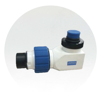
Easy360 Mobile Phone Adapter

Dual iris diaphragm is used to increase the depth of field.